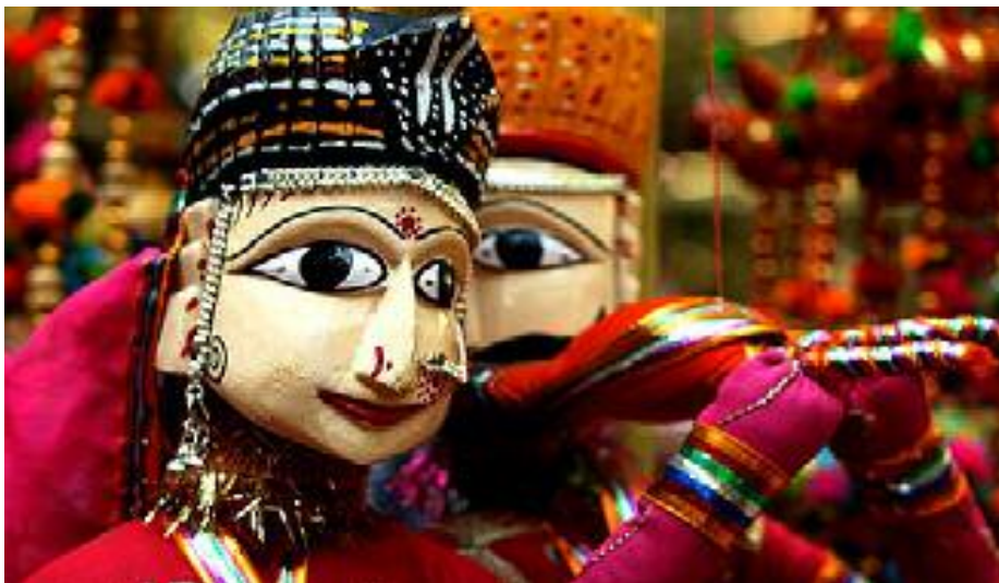
Dancing Puppets At Choki Dhani

Live dance and music performances through the evenings are one of the major attractions at Chokhi Dhani .