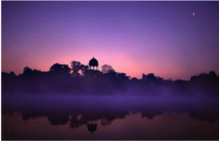
Dawn On The River Yamuna At Agra