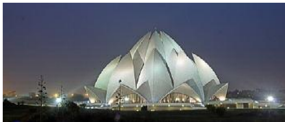
.Lotus Temple At New Delhi