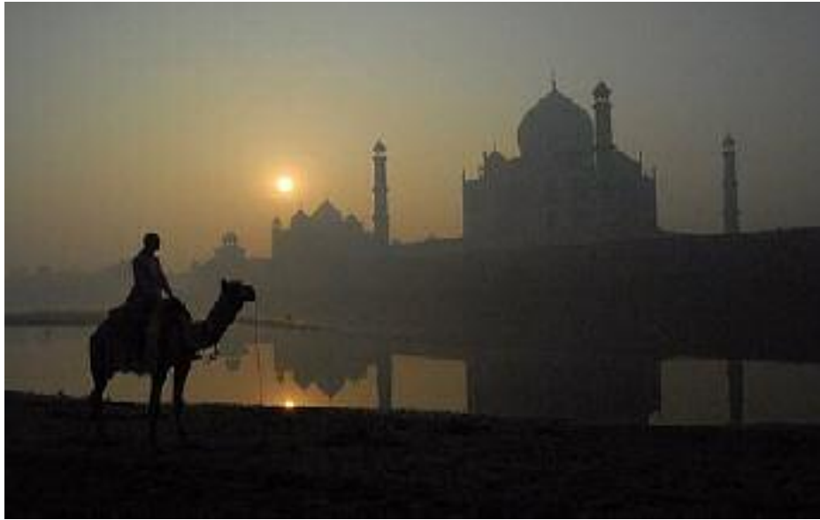
The Taj Mahal At Sunrise