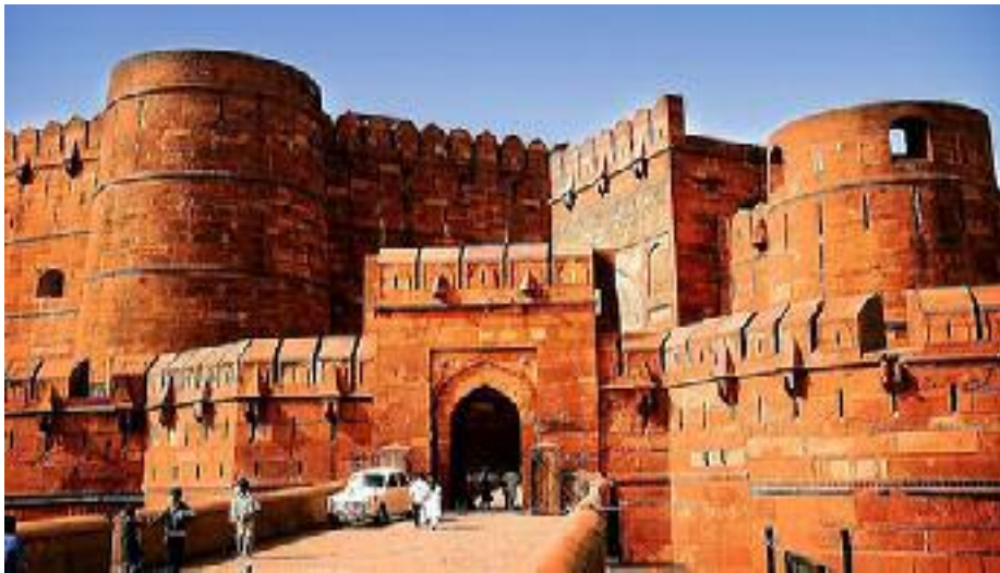
The Red Fort At Agra

The powerful fortress of red sandstone encompasses within its 1.5 mile-long enclosure walls many fairytale palaces such as the Jahangir Palace and the Khas Mahal , audience halls such as the Diwan-i-Khas , and Sheesh Mahal (The Glass Palace) which is inlaid with thousands of mirrors and was once the harem's dressing room.