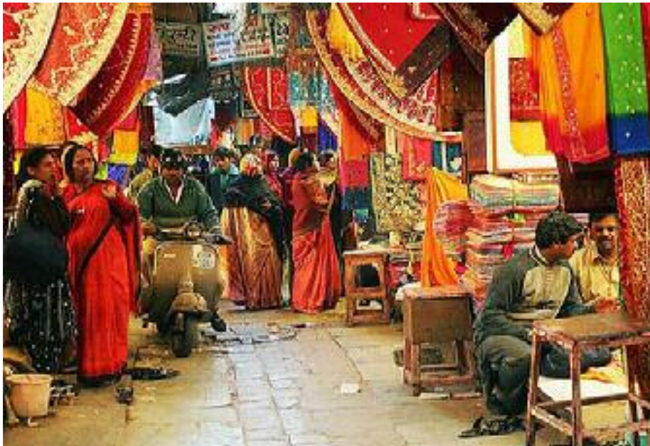
Sari Market At Jaipur

Jaipur contains some of the most famous markets in India . All of the bazaars are located within the old walled city area. They are the perfect place to shop for handicrafts, antiques, jewellery, gems, pottery, carpets, textiles, metalwork and leatherware.