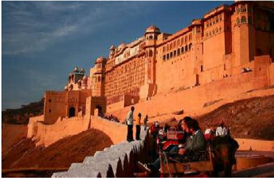
The Breathtaking Amber Fort