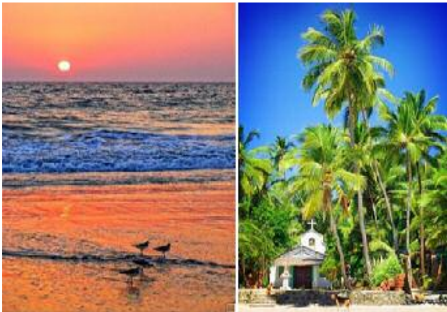
Colva And Palolem Beaches

The best known of India's beach resorts, Goa's renowned beaches continue to attract visitors with a variety of accommodation to suit all budgets. The beaches are all so different from tropical Palolem in the south, the old hippy beaches at Arambol and lovely golden beaches of soft sand girdled with palm trees at Cavelossim and Varca . At Colva and Benaulim the sea, sand and sky blend in a enchanting natural harmony and Calangute is known as the ' Queen Of All Beaches '.