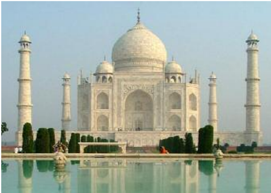
Classic View Of The Taj Mahal

The Taj Mahal is the world's greatest monument to love. Set overlooking the River Yamuna , the Taj was built by Emperor Shah Jahan to enshrine the body of his favourite wife in 1631. To truly appreciate the wondrous Taj Mahal and its many moods, you should aim to visit it at dawn or dusk when the reflection of the sun changes the colour of the dome from white to shades of pink.