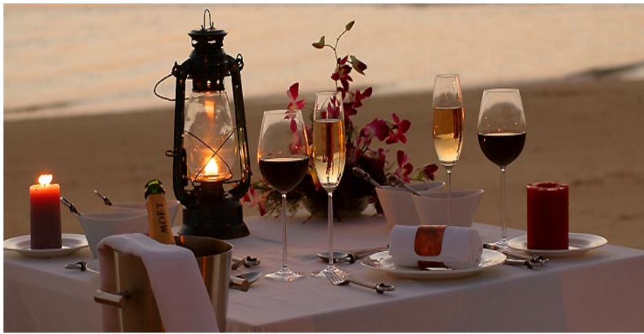
Dining At Park Hyatt