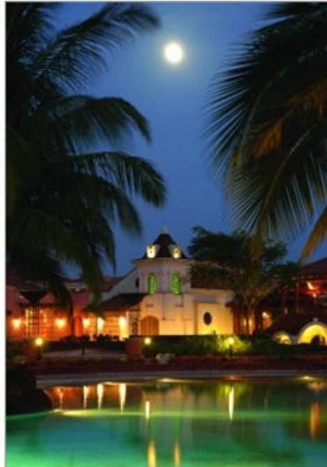
Park Hyatt Pool