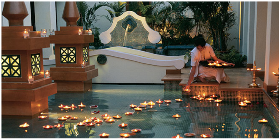
Park Hyatt Pool