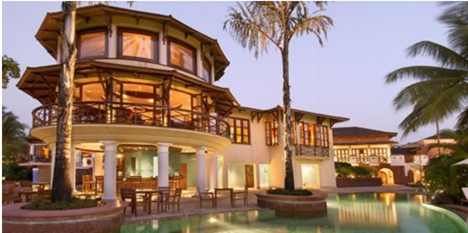
Park Hyatt Goa