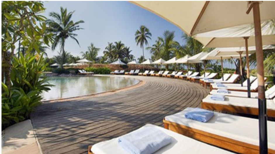
Park Hyatt Pool

Enjoy an epicurean journey of Italy at Da Luigi . Located at the Village Square , a casual friendly Italian trattoria offering a wide selection of authentic pizzas, fresh pastas and presents an array of delights for lunch and dinner.