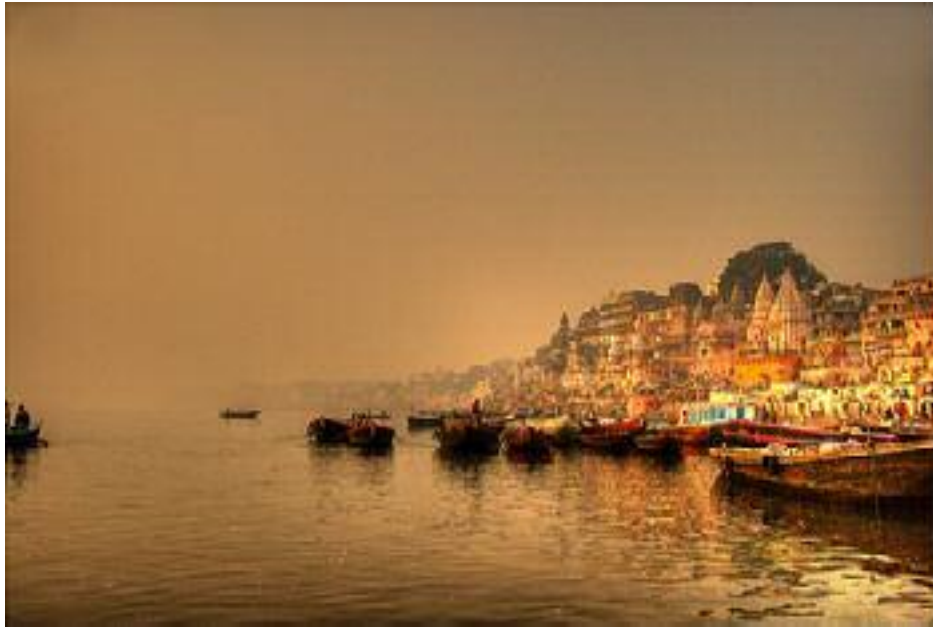
The Bathing Ghats At Varanasi