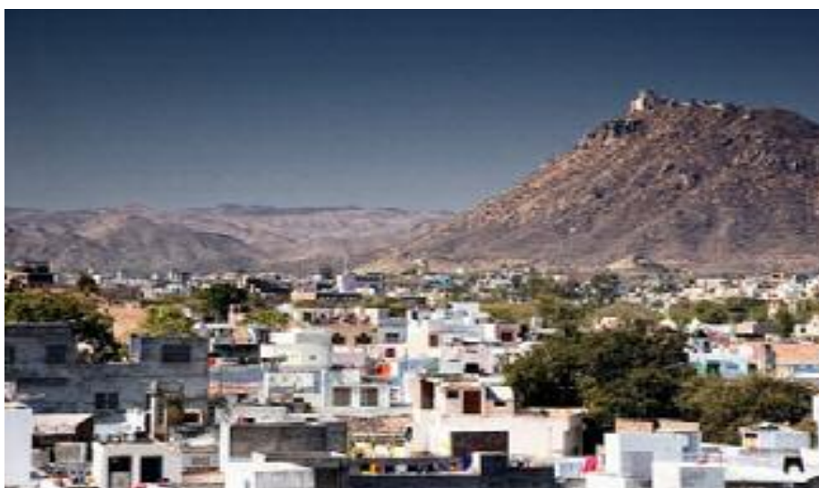
The Monsoon Palace Above Udaipur

The view of Udaipur from the Monsoon Palace is not to be missed. It is located high up on a peak in a forest covered wildlife sanctuary just outside the city.