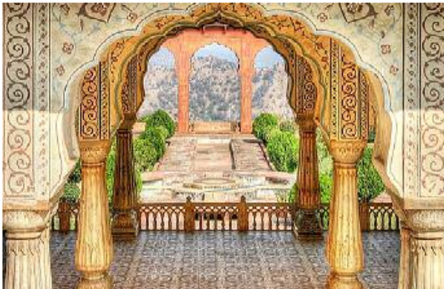
Beautiful Palace At Amber Fort

Amber is situated about 7 miles from Jaipur and was the ancient citadel of the ruling clan of Amber . The Amber Fort (1592) set in picturesque and rugged hills is a fascinating blend of Hindu and Mughal architecture. The forbidding exterior belies an inner paradise with a beautiful fusion of art and architecture. Amber is the classic and romantic fort-palace with a magnificent aura and you have the added attraction of an Elephant Back Ride to ascend to the top.