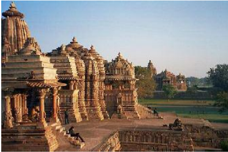
The Temples At Khajuraho