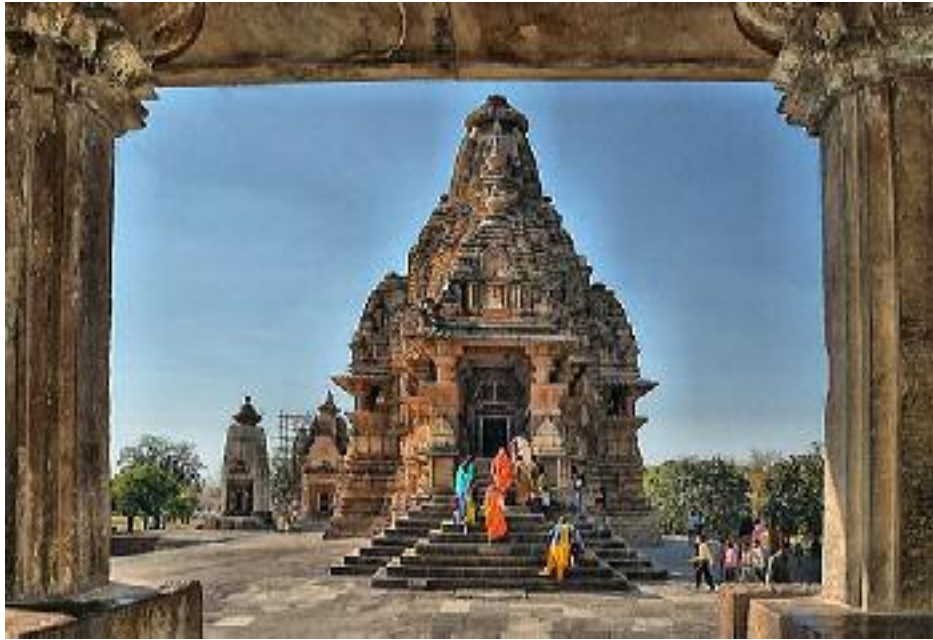
The Temples At Khajuraho