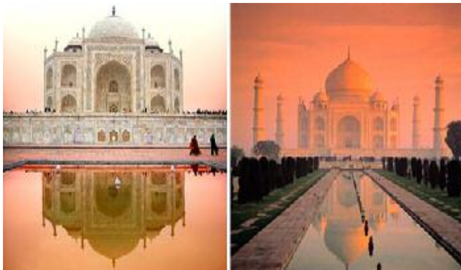
Views Of The Taj Mahal