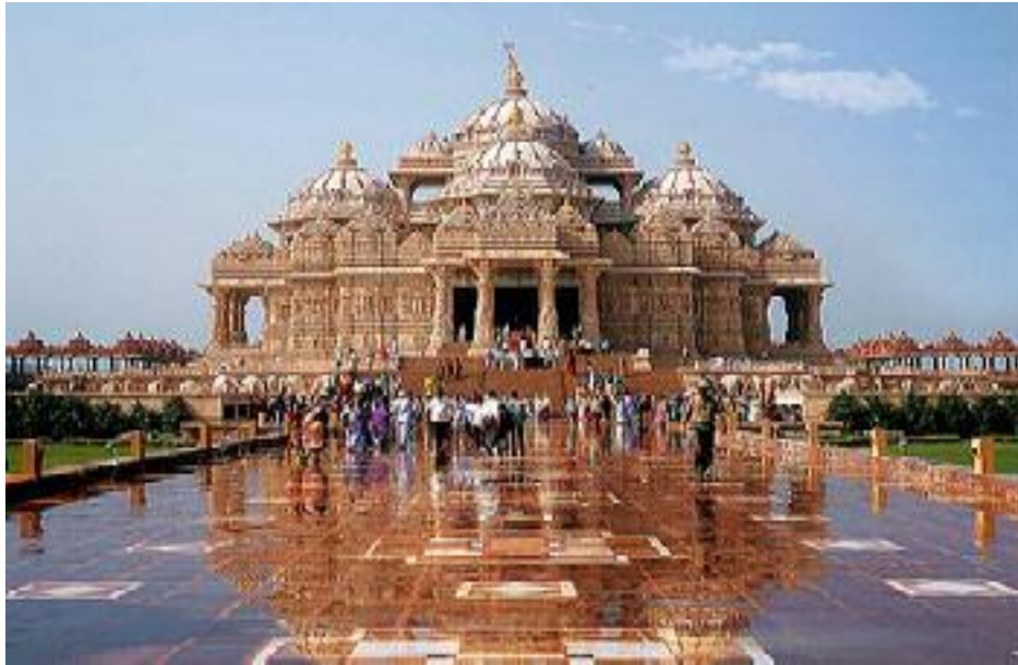
Akshardham Temple In New Delhi