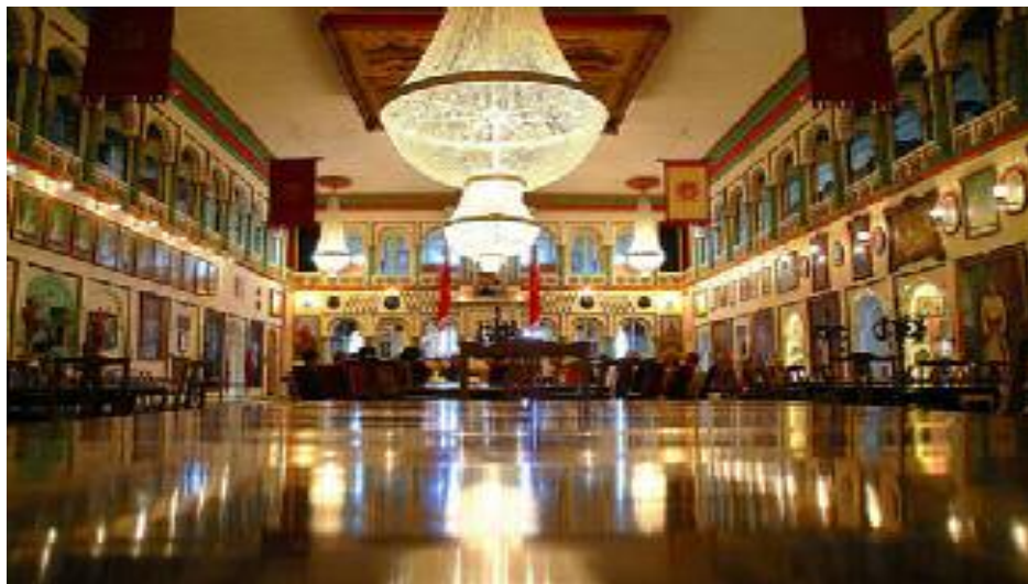
Durbar Hall At Fateh Prakash Palace