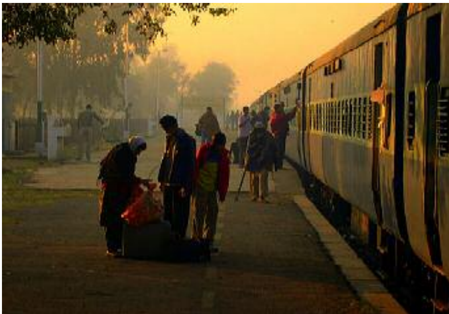
Romance Of Indian Railway Travel

An overland Train Journey In India is truly one of the classic Indian travel experiences. There are daily express trains from the railway junction at Jhansi to Agra .