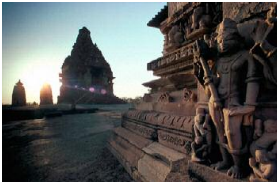
Viswanatha Temple At Khajuraho