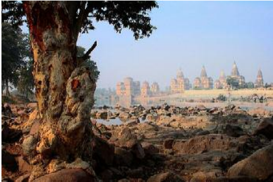
Orchha By The Betwa River