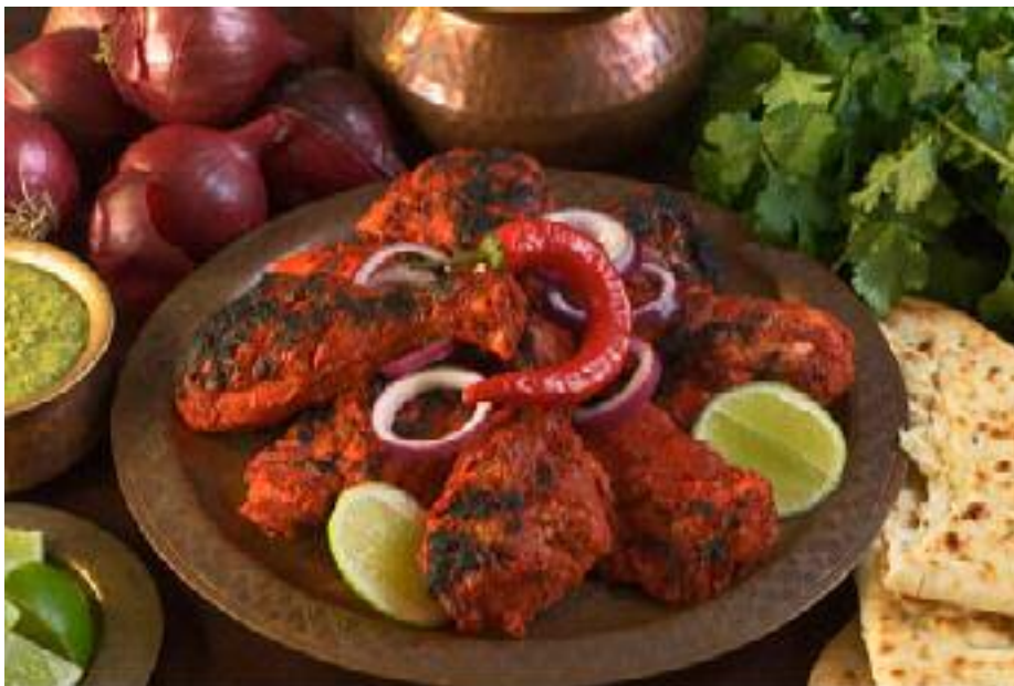
Delicious Delhi Cuisine

Humayun's Tomb is one of Delhi's three UNESCO World Heritage Sites . The tomb is located in large, immaculately maintained gardens. The Qutub Minar (1193 AD) is the tallest brick minaret in the world (238 ft) and an architectural wonder of India .