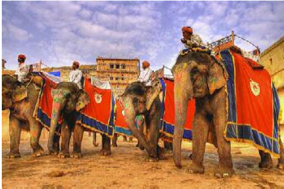
On Elephant Back To Amber Fort