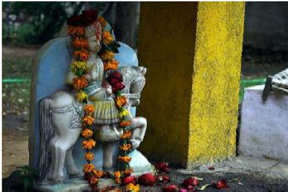
Minature Shrine At Orchha

Standard Rooms Unless Otherwise Specified