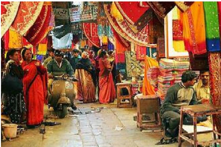
Saree Market At Jaipur

The Palace Of The Winds (Hawa Mahal) is Jaipur's most acclaimed attraction. Built in 1799, overlooking one of the city's main streets to offer the women of the court a vantage point, behind stone-carved screens, from which to watch the activity in the bazaars below.