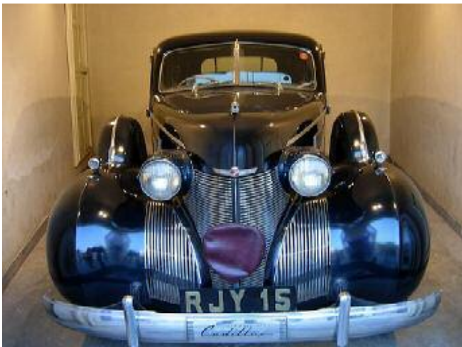
The Maharajah's Old Cadillac

During the winter season, there is a very watchable Son Et Lumiere Show that showcases the history of the City Palace from a magnificent setting on the banks of Lake Pichola .