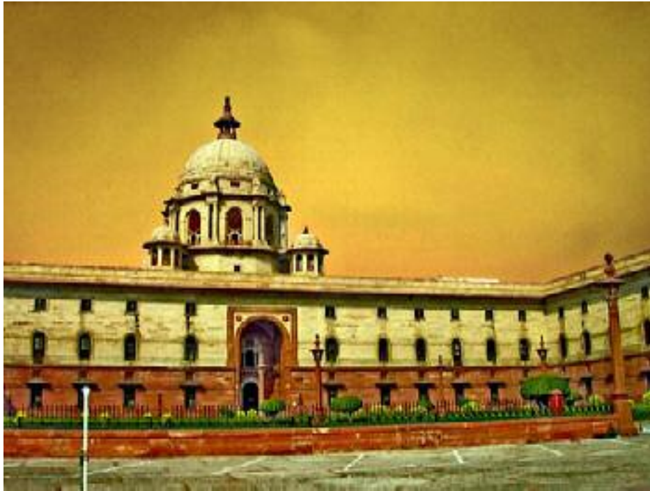
Colonial Grandeur Of New Delhi