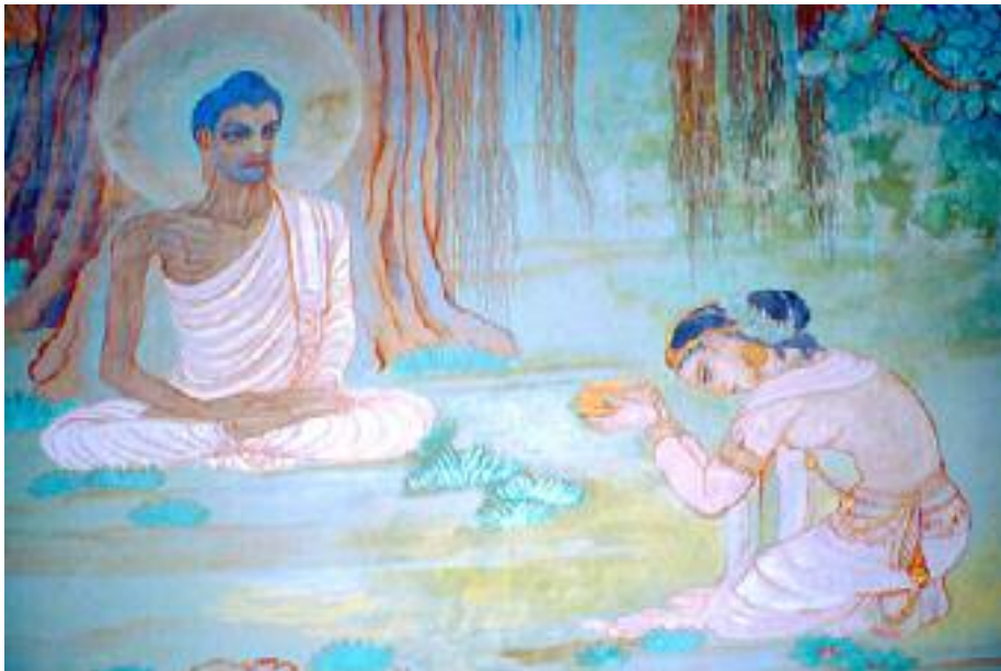
Buddhist Fresco At Mulaghandakuti Vihare Temple At Sarnath

Within the Deer Park complex is the Dhamekha Stupa constructed by the Emperor Ashoka in 249 BC.