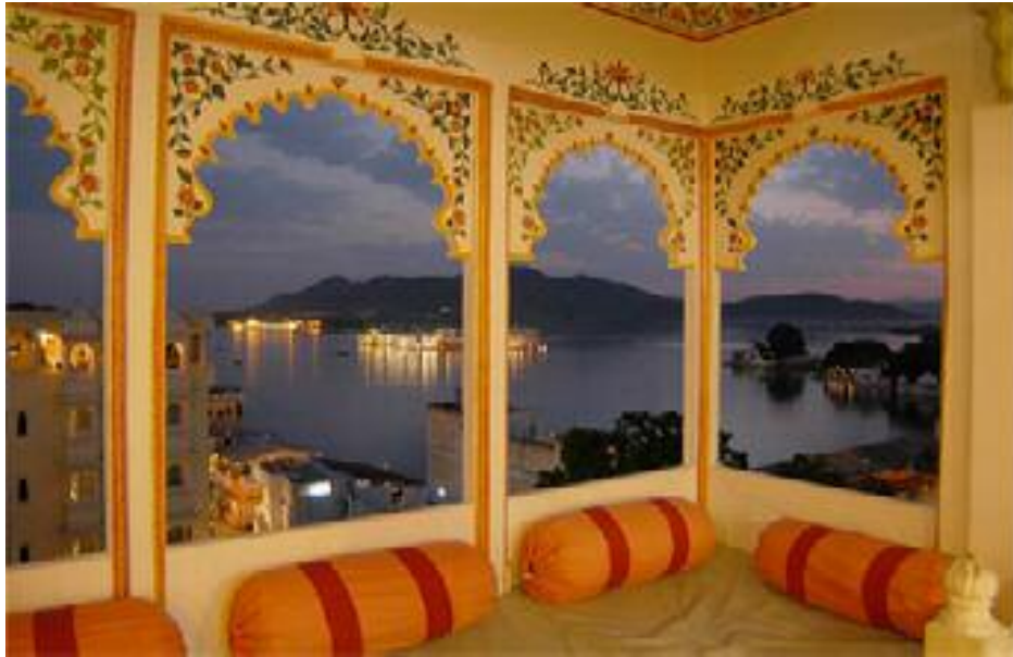
Evening View Of Udaipur