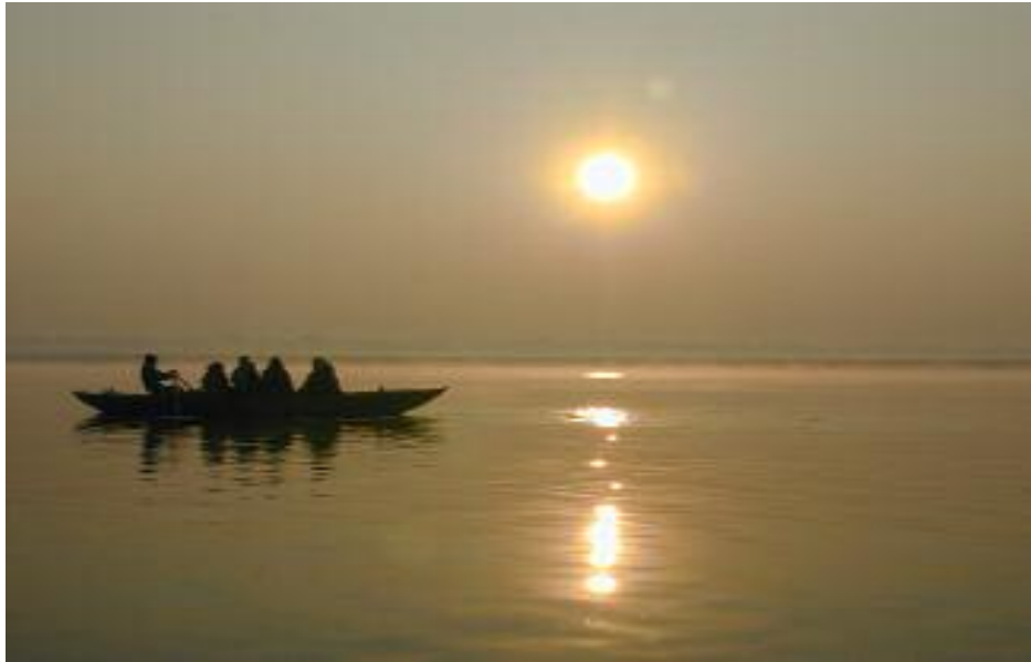
Sunrise On The Ganges At Varanasi