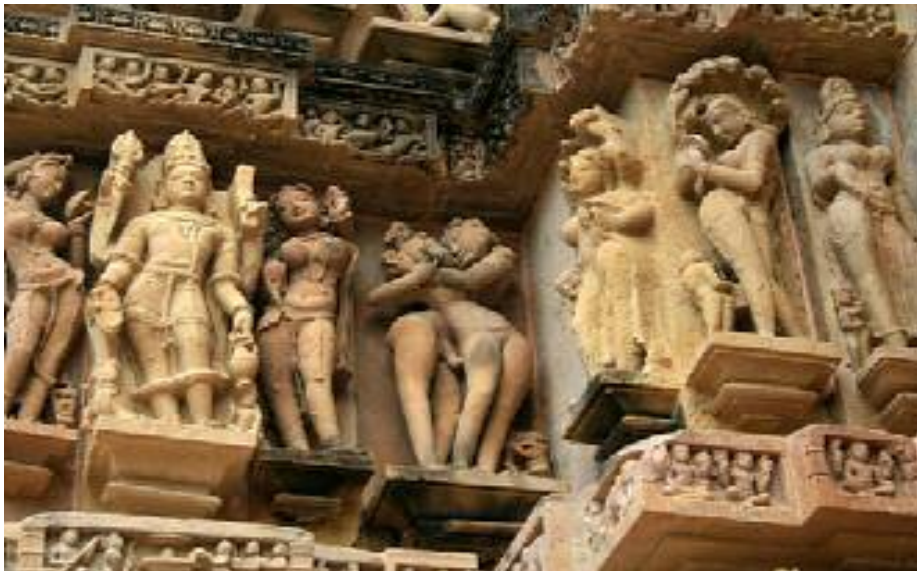
The Famous Khajuraho Sculptures

The fascinating Son-et-Lumière spectacle evokes the life and times of the great Chandela Kings and traces the story of the unique temples from the 10th Century to the present day. Mounted in the complex of the Western Group Of Temples , the 50-minute show runs in English every evening. Amitabh Bachchan , the Indian movie superstar, narrates the story of Khajuraho in his mesmerising voice.