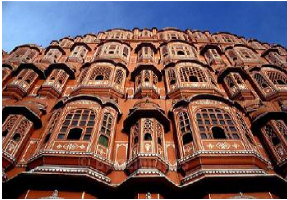
The Palace Of Winds At Jaipur