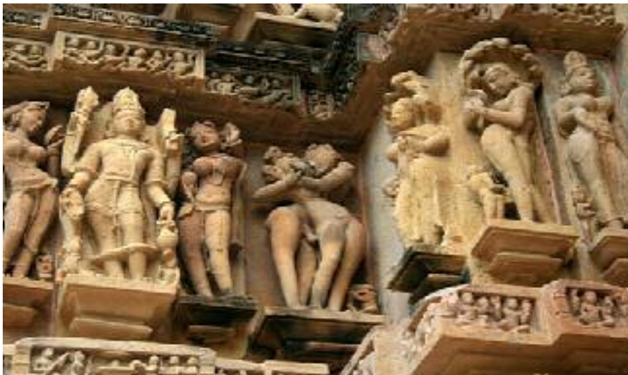
The Famous Khajuraho Sculptures

Unlike other cultural centers of North India , the temples of Khajuraho never underwent massive destruction and a number of them have survived. They are fine examples of Indian architectural styles that have gained popularity due to their salacious depiction of the traditional way of life during medieval times. They were rediscovered during the late 19th century but the jungles had taken a toll on some of the monuments.