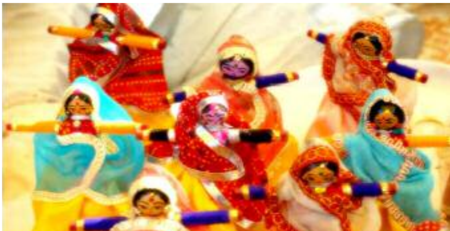
Traditional Dolls At A Market Stall

Rajghat , the cremation site of Mahatma Gandhi is also a popular place for visitors.