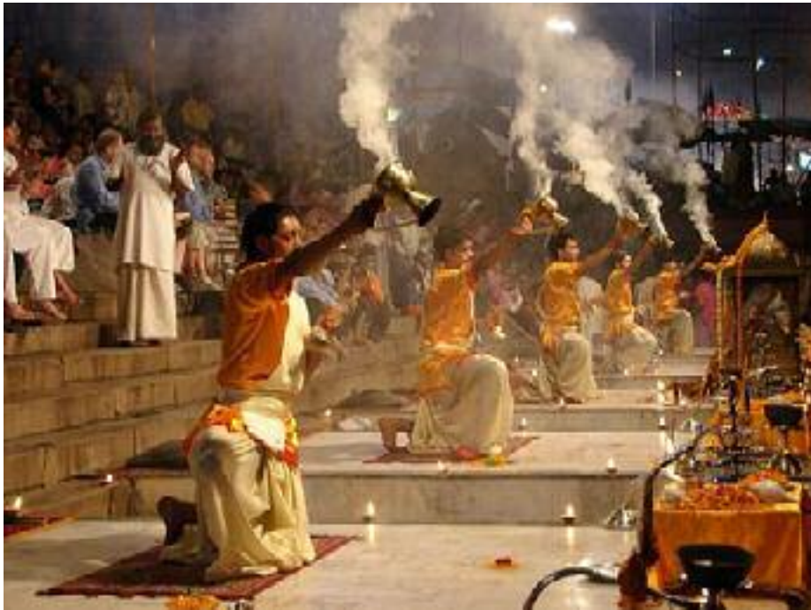
Aarti Ceremony At Varanasi

In the evening you may observe the Aarti ceremonies on the riverbanks. Aarti is often called "The Ceremony Of Lights" where the priest offers various auspicious articles before a deity. The Aarti lamp is then passed around the congregation.