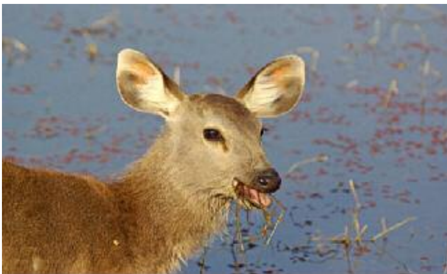
Sambar Cub At Ranthambhore

The park's abandoned fortress, lakes and above all it's 'friendly' tigers have made it one of the most filmed and photographed wildlife reserves in the world.