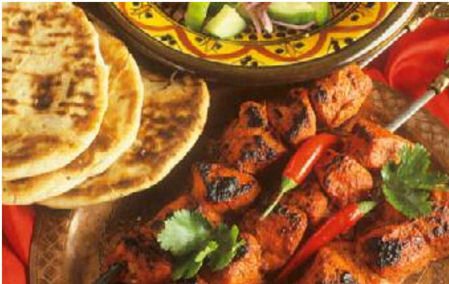
Delicious Delhi Cuisine

Rajghat , the cremation site of Mahatma Gandhi is also a popular place for visitors.