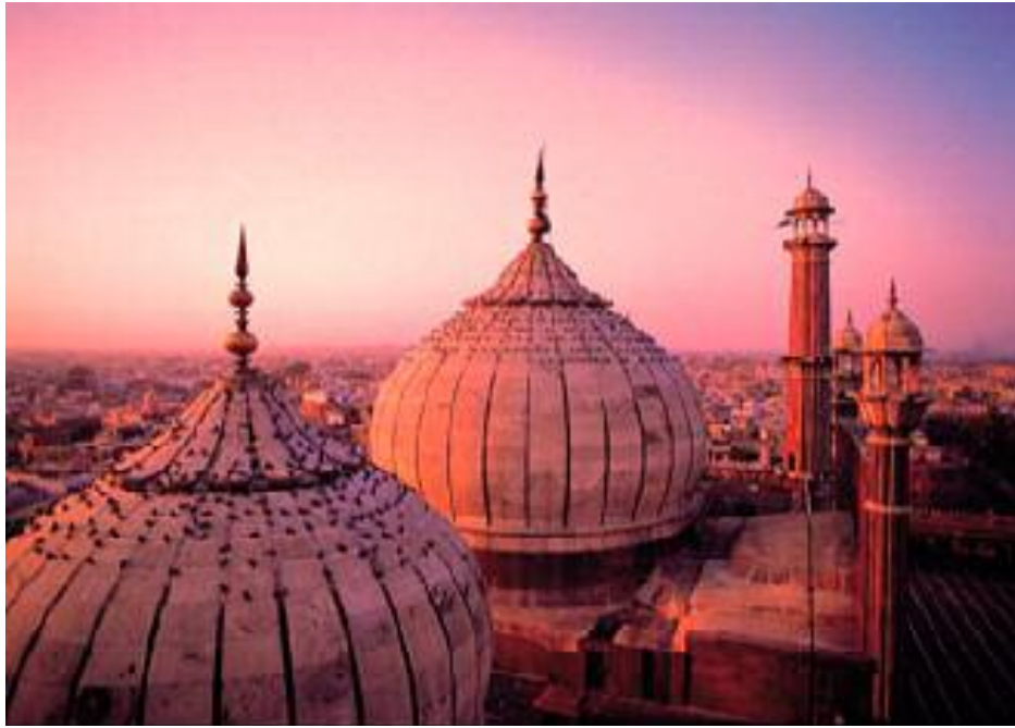
Old Delhi From The Domes Of The Jama Masjid