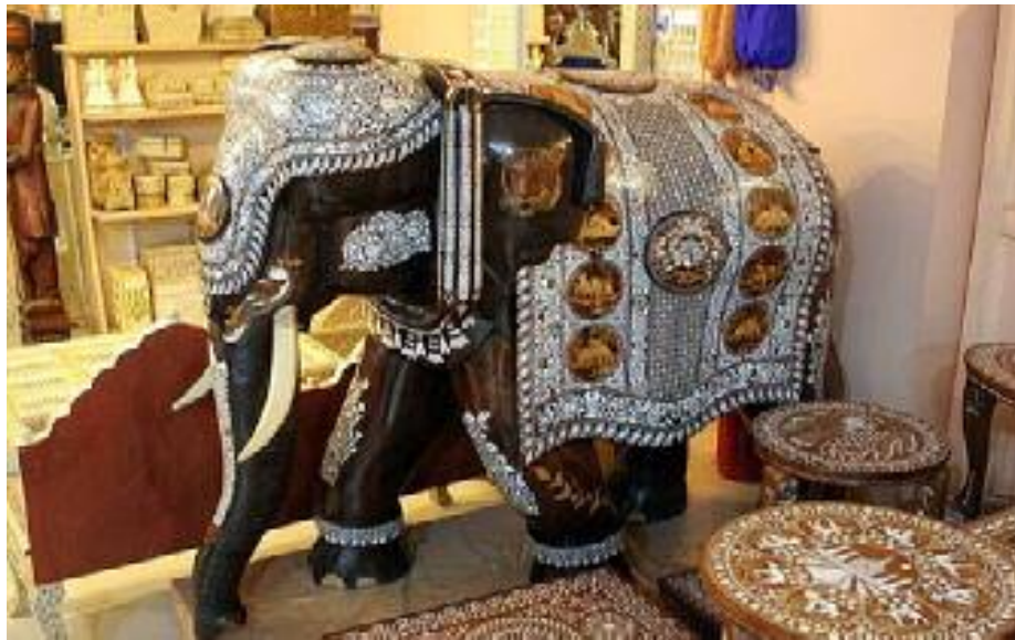
Indian Crafts On Display At Delhi