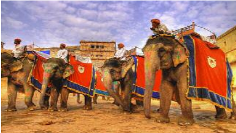
Elephant Back Ride To Amber Fort