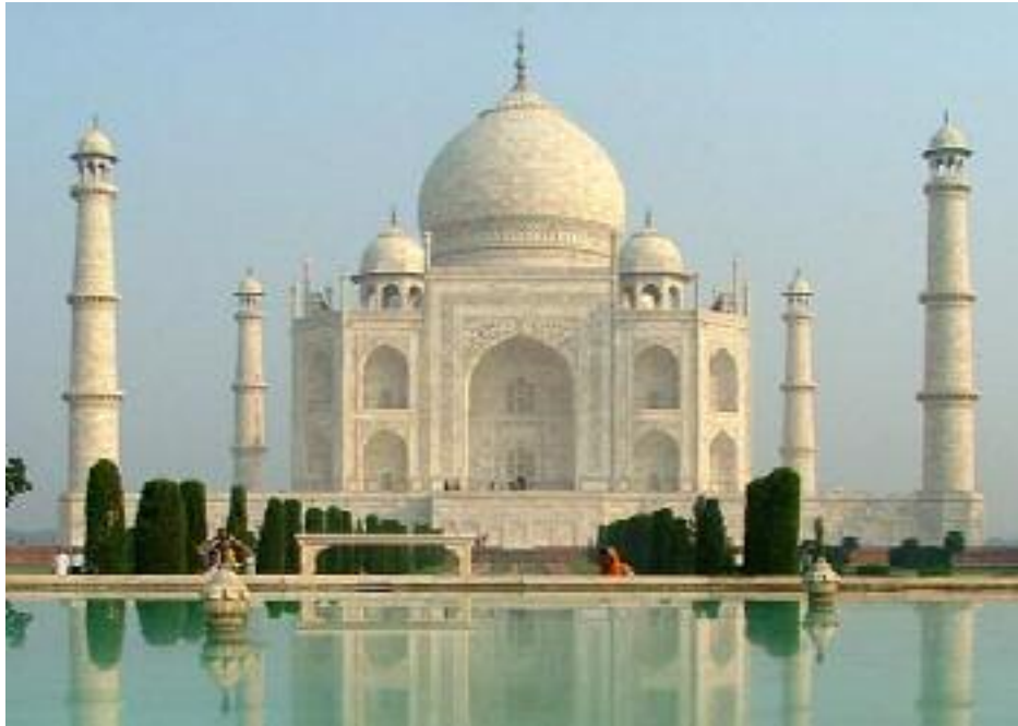
Classic View Of The Taj Mahal