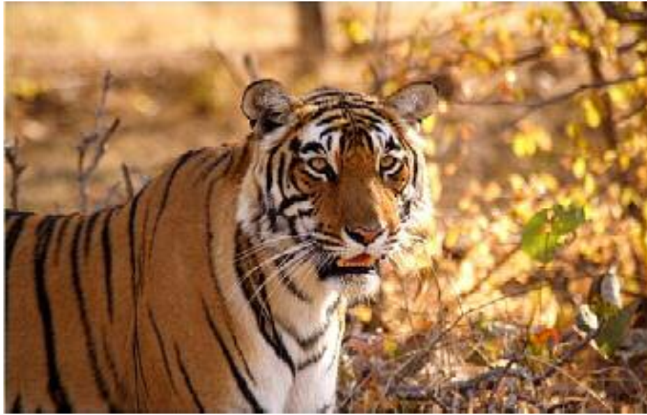
Tiger At Ranthambhore