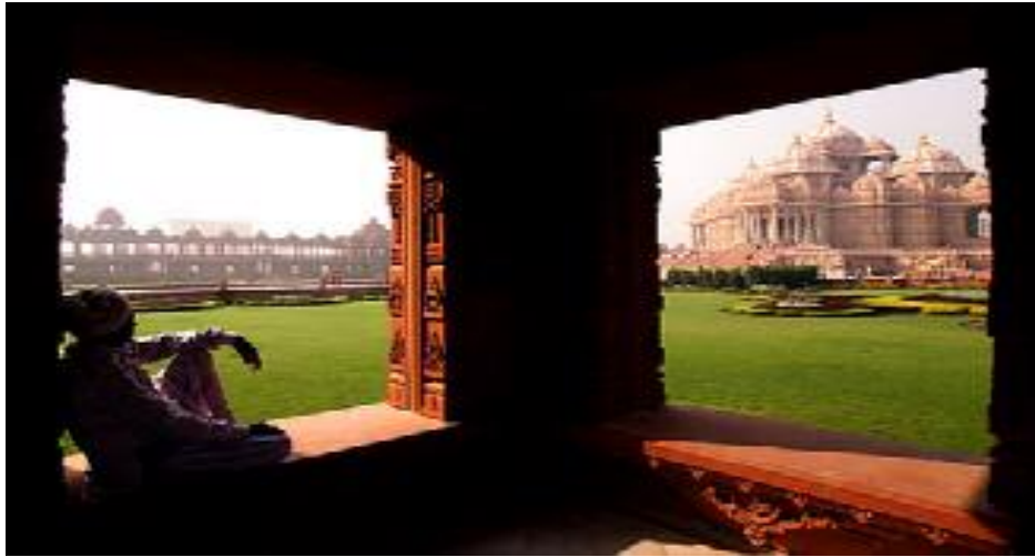
Akshardham Temple In New Delhi