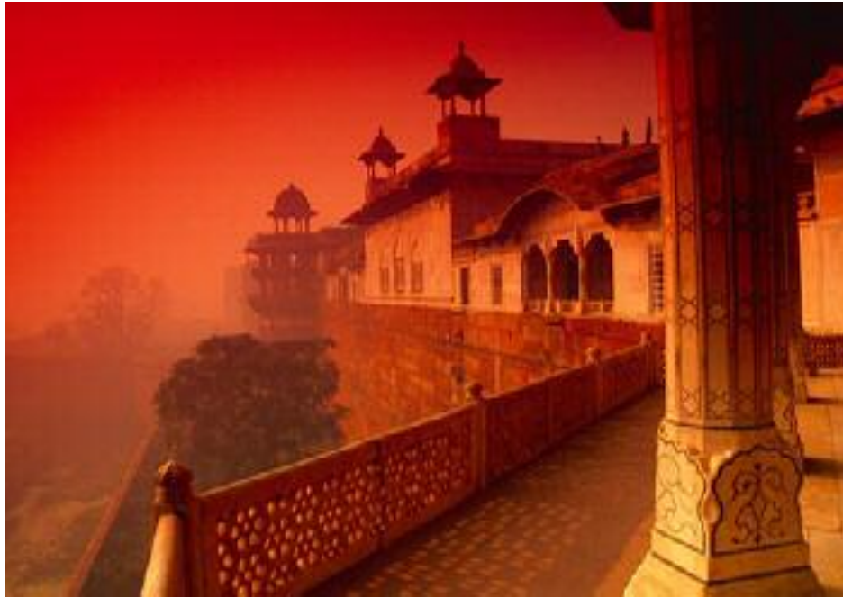
Dawn Over The Red Fort Of Agra