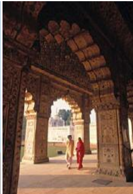
Qutub Minar And Interior Of The Red Fort Of Delhi