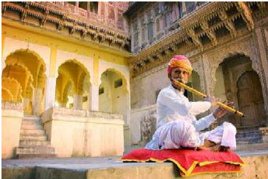
Musician At Amber Palace

Jaipur is often called the Pink City in reference to its distinctly coloured buildings, which were originally painted this colour to imitate the red sandstone architecture of Mughal cities. The present earthy red color originates from repainting of the buildings undertaken for a visit by the Prince Of Wales in 1876.