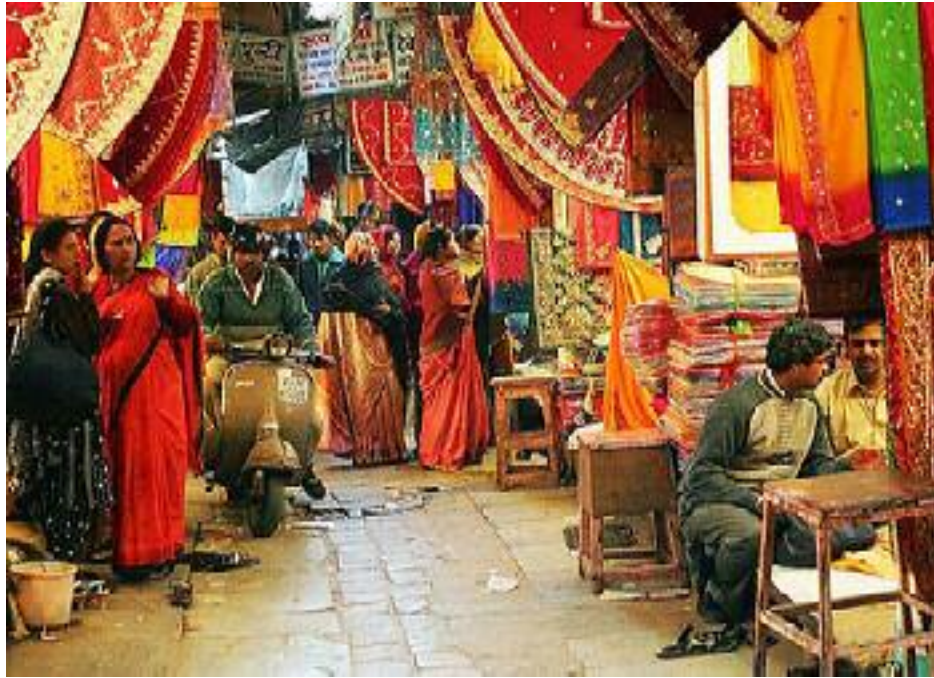
Saree Market At Jaipur