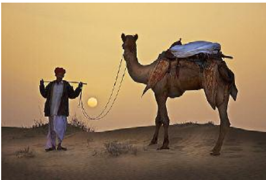
Rural Life On The Way To Jaipur

The deserted city of Fatehpur Sikri was the capital of Emperor Akbar between 1570 and 1585. Due to a severe shortage of water the city was abandoned after only fifteen years and the capital was relocated back to Agra . As a result Fatehpur Sikri stands untouched and perfectly preserved, a complete medieval fortress of red sandstone, with vast central squares, exquisitely carved multi-tiered pavilions, cool terraces and formal gardens.