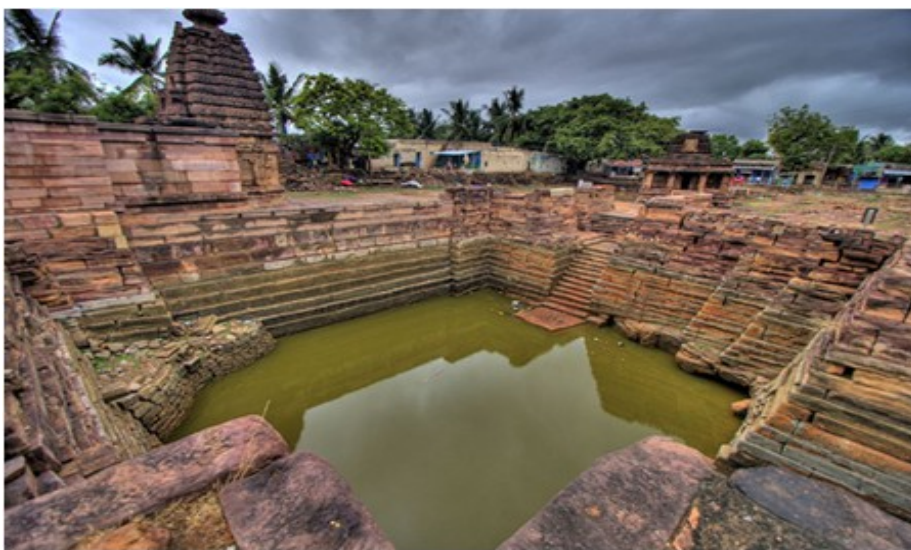
Ancient Pond At Aihole

The oldest temple here is the Lad Khan Temple dating back to the 5th Century. The Durga Temple is notable for its semi-circular apse, elevated plinth and the gallery that encircles the sanctum. The Hutchimali Temple out in the village - has a sculpture of Vishnu sitting atop a large cobra. The Revalphadi Cave - dedicated to Shiva - is remarkable for its delicate details.