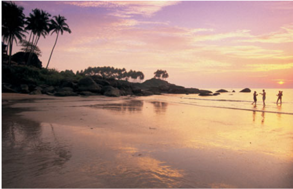
Sunset Over Goa