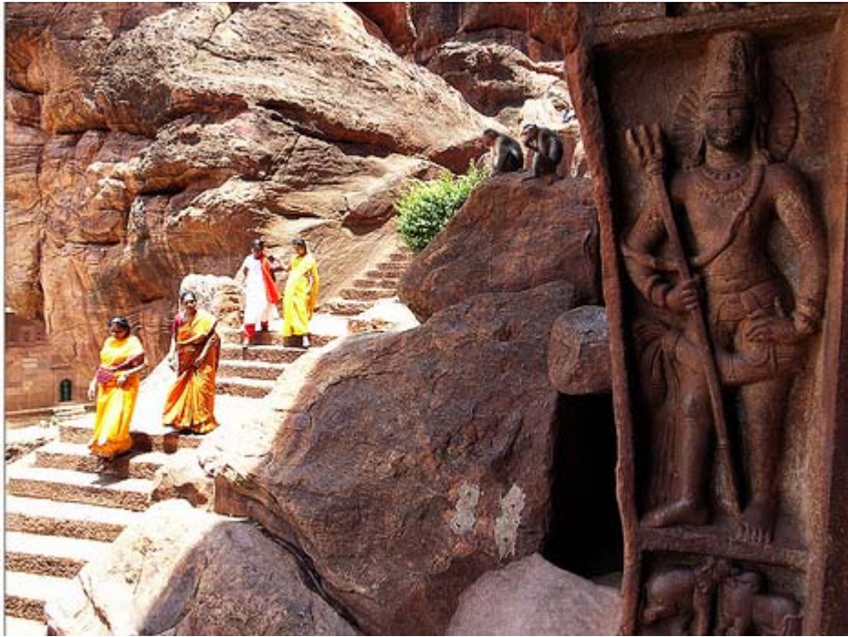
Cave No1 At Badami