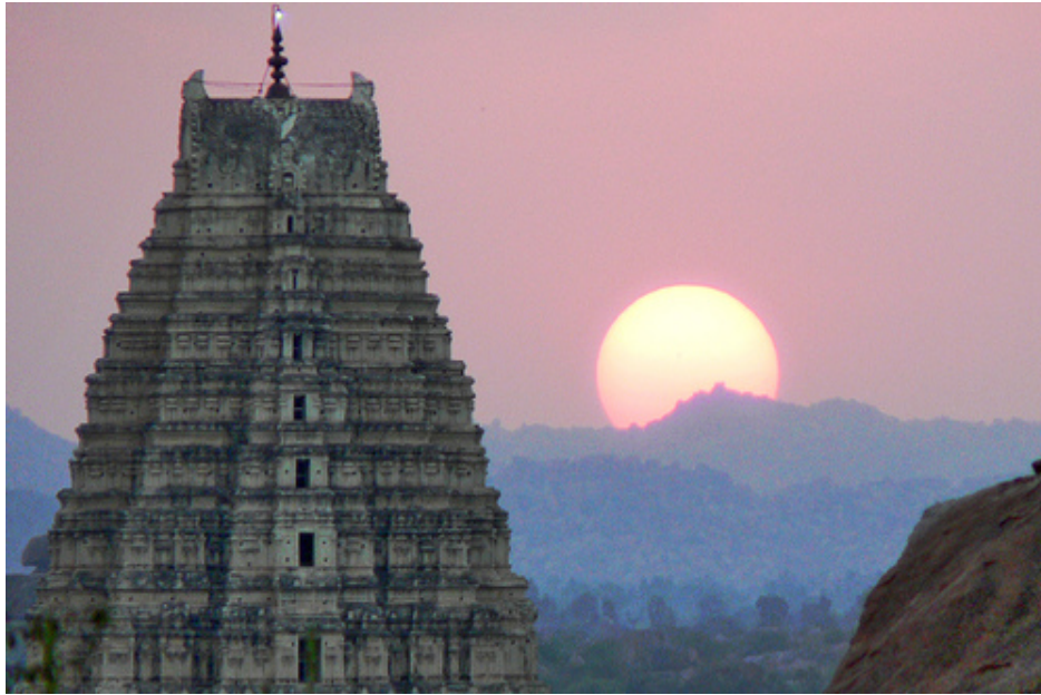
Sunset Over Hampi