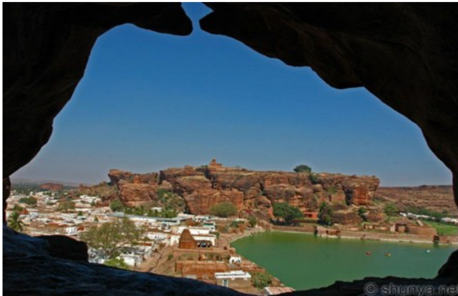
View From Badami Cave Temple

Badami lies at the foot of a rugged, red sandstone outcrop that surrounds Agastya Tirtha lake on three sides. Once the capital of the Chalukyas , Badami is best known today for its rock-cut cave temples. The caves, sculpted in the 6th and 7th centuries, depict Hindu , Buddhist and Jain iconography. Cave 1 is devoted to Shiva , Caves 2 and 3 are dedicated to Vishnu , and Cave 4 displays reliefs of Jain Tirthankaras . A natural cave nearby is dedicated to the Buddha . Carvings of Hindu Gods are strewn across the area in other caverns and on boulders.